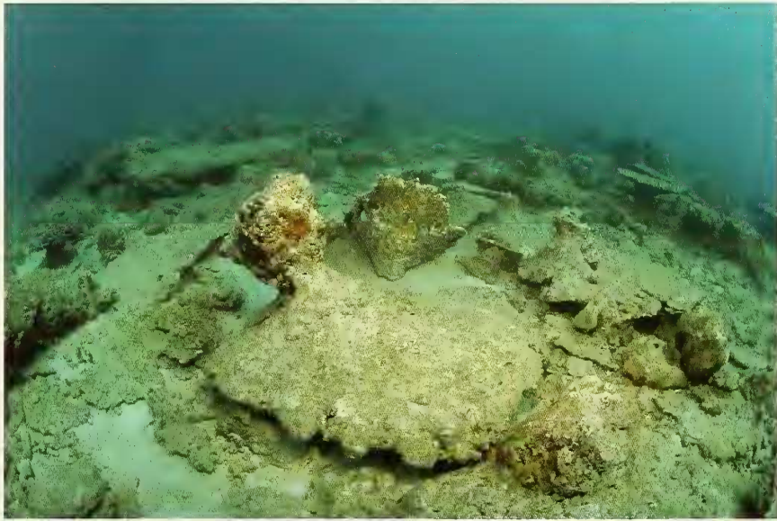
Figure 7. Overturned dead Acropora sp. table at 4 m water depth on the north coast of Aceh Province, October 27, 2005.

Moving eastward, two surveys were conducted in a large bay area. One of these surveys was of particular interest as it identified considerable tsunami damage, specifically overturned dead Acropora tables (Fig. 7), overturned live Porites spp. (Fig. 8) and tree debris (Fig. 9).